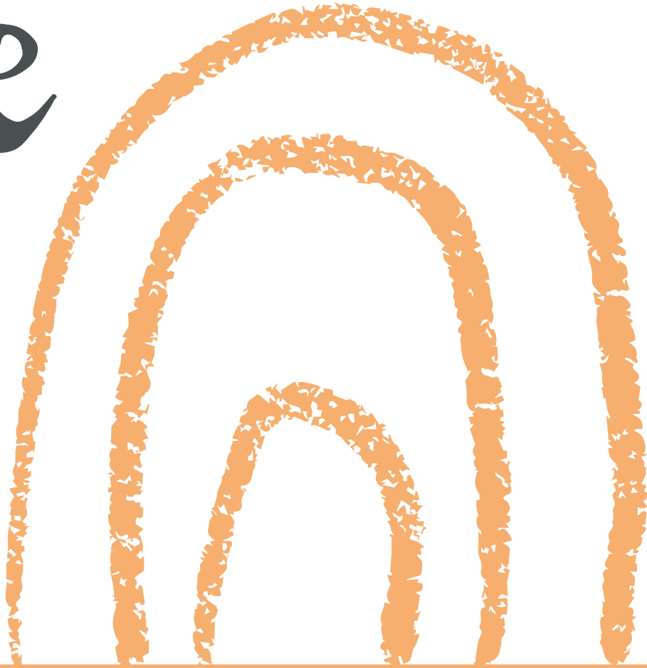
Table Talk 2021